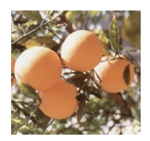
GLOBAL KNOWLEDGE PARTNERSHIP Sharing Knowledge • Building Partnerships