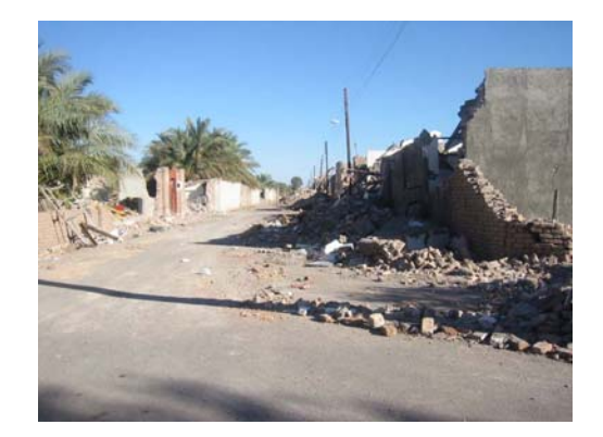
GLOBAL KNOWLEDGE PARTNERSHIP Sharing Knowledge • Building Partnerships