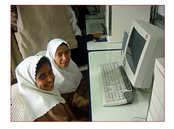
GLOBAL KNOWLEDGE PARTNERSHIP Sharing Knowledge • Building Partnerships